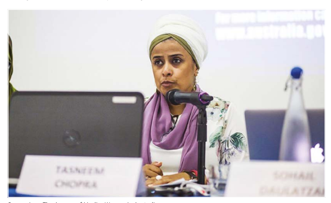
Symposium, The Agency of Muslim Women in Australia