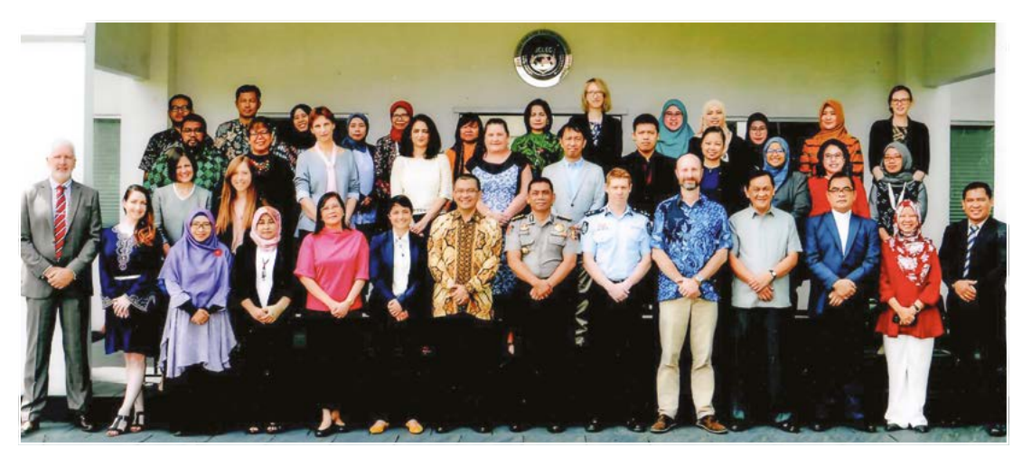
Building Government-CSO Partnerships, Semarang, Indonesia